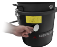
JC Jet Clean Pulizia semiautomatica a contro corrente d'aria, classe M filtro (EN 60335-2-69), 1 filtro cartuccia poliestere, 4 m 2 superficie filtrante, ghigliottina non inclusa