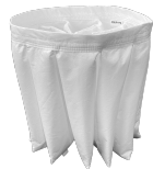
BFL Filtro classe M 38.000 cm 2