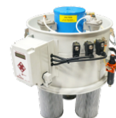
SP Pulizia cartucce in controcorrente d'aria Filtro antistatico classe M (EN 60335-2-69) 3 cartucce poliestere antistatico 9 m 2 superficie filtrante