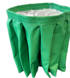
MTF Filtro teflonato (Classe M EN 60335-2-69)