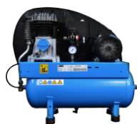
COM Compressore a bordo Compressore montato su carenatura posteriore