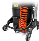
KDP KIT differenziale di pressione per insaccamento