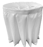
PTFE Filtro PTFE (Classe M EN 60335-2-69)