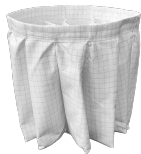
ANT M Filtro antistatico (Classe M EN 60335-2-69)