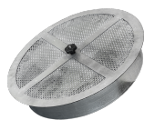
ACB Filtro carboni attivi