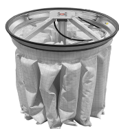
PSC Scuotifiltro Pneumatico