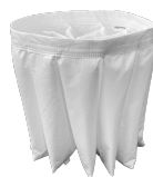
BFL Filtro classe M 38.000 cm 2