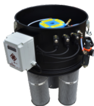
SP Pulizia cartucce in controcorrente d'aria Filtro antistatico classe M (EN 60335-2-69) 3 Cartucce poliestere antistatico 9 m 2 superficie filtrante