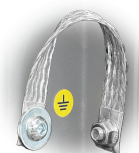
GRD Messa a terra