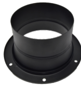
P12300/120 FLANGIA CONNESSIONE FLESSIBILE Ø 120MM Flangia di accoppiamento su aspiratore industriale DF per tubo flessibile diametro 120 mm