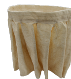
NOMEX Filtro resistente 250° Celsius