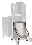
BX Contenitore in acciaio INOX AISI 304