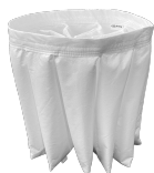
PTFE Filtro PTFE (Classe M EN 60335-2-69)