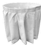
ANT M Filtro antistatico (Classe M EN 60335-2-69)