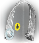
GRD Messa a terra