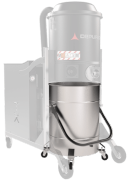
BX Contenitore in acciaio INOX AISI 304