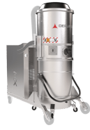
TX Contenitore camera e struttura in acciaio INOX AISI 304