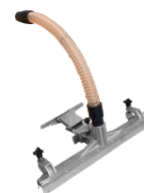
P00327 SPAZZOLA FISSA WET & DRY Ø 50MM Accessorio fisso wet & dry con connessione a tubo flessibile D50 mm