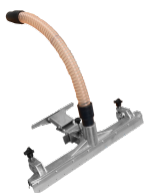
P00327 SPAZZOLA FISSA WET & DRY Ø 50MM Accessorio fisso wet & dry con connessione a tubo flessibile D50 mm