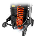
KDP KIT differenziale di pressione per insaccamento