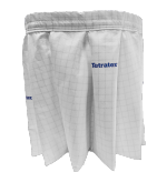
PTFE ANT Filtro PTFE antistatico (Classe M EN 60335-2-69)