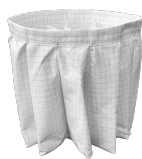
ANT M Filtro antistatico (Classe M EN 60335-2-69)