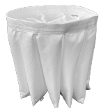
PTFE Filtro PTFE (Classe M EN 60335-2-69)