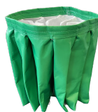
MTF Filtro teflonato (Classe M EN 60335-2-69)