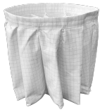
ANT M Filtro antistatico (Classe M EN 60335-2-69)