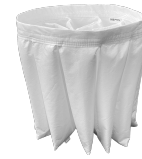
PTFE Filtro PTFE (Classe M EN 60335-2-69)