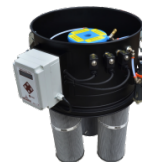
SP Pulizia cartucce in controcorrente d'aria Filtro antistatico classe M (EN 60335-2-69) 3 Cartucce poliestere antistatico 9 m 2 superficie filtrante