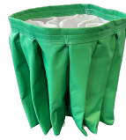
MTF Filtro teflonato (Classe M EN 60335-2-69)