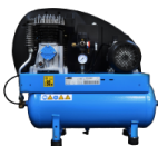
COM Compressore a bordo Compressore montato su carenatura posteriore