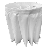
PTFE Filtro PTFE (Classe M EN 60335-2-69)