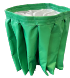
MTF Filtro teflonato (Classe M EN 60335-2-69)