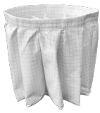
ANT M Filtro antistatico (Classe M EN 60335-2-69)