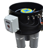
SP Pulizia cartucce in controcorrente d'aria Filtro antistatico classe M (EN 60335-2-69) 3 Cartucce poliestere antistatico 9 m 2 superficie filtrante