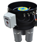
SP Pulizia cartucce in controcorrente d'aria Filtro antistatico classe M (EN 60335-2-69) 3 Cartucce poliestere antistatico 9 m 2 superficie filtrante