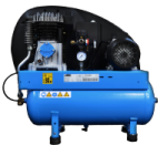
COM Compressore a bordo Compressore montato su carenatura posteriore