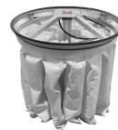
PSC Scuotifiltro Pneumatico