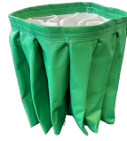
MTF Filtro teflonato (Classe M EN 60335-2-69)