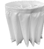
PTFE Filtro PTFE (Classe M EN 60335-2-69)