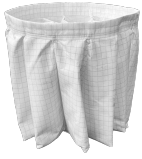
ANT M Filtro antistatico (Classe M EN 60335-2-69)