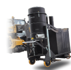
FKL Supporto sollevamento per muletto