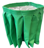
MTF Filtro teflonato (Classe M EN 60335-2-69)