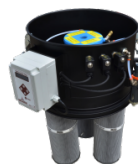
SP Pulizia cartucce in controcorrente d'aria Filtro antistatico classe M (EN 60335-2-69) 3 Cartucce poliestere antistatico 9 m 2 superficie filtrante