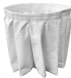
ANT M Filtro antistatico (Classe M EN 60335-2-69)