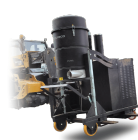
FKL Supporto sollevamento per muletto