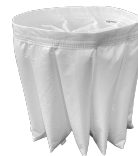
PTFE Filtro PTFE (Classe M EN 60335-2-69)