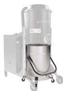
BX Contenitore in acciaio INOX AISI 304