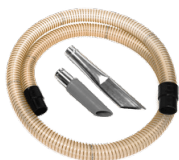
P12352 KIT OLIO E TRUCIOLO Ø 50MM. Kit base di accessori specifici per applicazione aspirazione olio e trucioli in diametro 50 mm