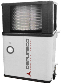
POST H Post-Cartuccia