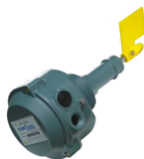
P10166 SENSORE DI LIVELLO ROTATIVO Sensore motorizzato in bassa tensione 24V con paletta rotante, certificato ATEX Z21