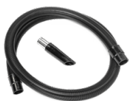
P12378 STARTER KIT ANTISTATICO Ø 50MM Kit base di accessori antistatici per applicazione con aspiratore ATEX in diametro 50 mm