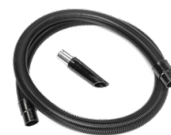
P12378 STARTER KIT ANTISTATICO Ø 50MM Kit base di accessori antistatici per applicazione con aspiratore ATEX in diametro 50 mm