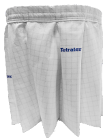
PTFE ANT Filtro PTFE antistatico (Classe M EN 60335-2-69)