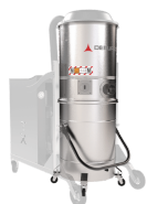
GX Camera e contenitore acciaio INOX AISI 304