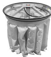
PSC Scuotifiltro Pneumatico