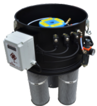
SP Pulizia cartucce in controcorrente d'aria Filtro antistatico classe M (EN 60335-2-69) 3 Cartucce poliestere antistatico 9 m 2 superficie filtrante