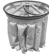
PSC Scuotifiltro Pneumatico