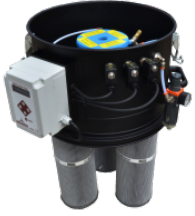
SP Pulizia cartucce in controcorrente d'aria Filtro antistatico classe M (EN 60335-2-69) 3 Cartucce poliestere antistatico 9 m 2 superficie filtrante