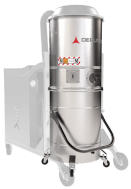
GX Camera e contenitore acciaio INOX AISI 304