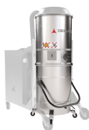
GX Camera e contenitore acciaio INOX AISI 304