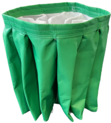
MTF Teflon filter (M class EN 60335-2-69)