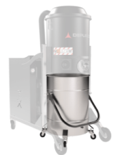
BX Stainless steel bin AISI 304