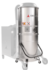
GX Stainless steel bin and chamber AISI 304