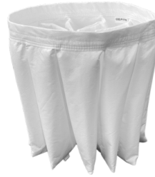
PTFE PTFE Filter (M class EN 60335-2-69)