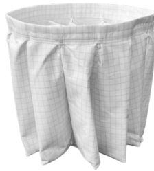
ANT M Antistatic filter (M class EN 60335-2-69)