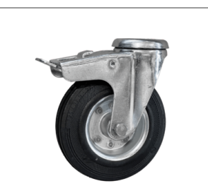
WHEEL WITH BRAKE Non-marking wheel with integrated brake