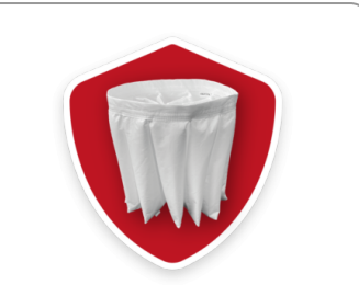
3 YEARS WARRANTY Purchasing the replacement filter along with the vacuum