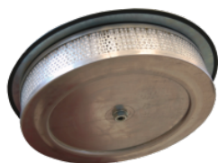
HEPA 14 Absolute filter (EN 1822-5)