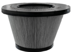
HEPA 13 Absolute filter (EN 1822) 35.000 cm 2 filter surface H13 Class Filter (EN 1822) Glass fiber