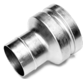
P00278 IRON REDUCER Ø 80/50MM Reducer for vacuum quick fitting in galvanised steel 80/50 mm diameter