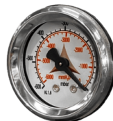
VACUUM GAUGE Vacuum gauge for indication of filter clogged or in need of replacement