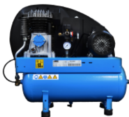
COM Compressor on board