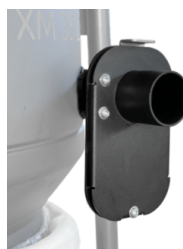
SD Sliding damper