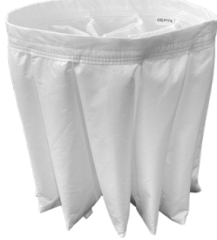
PTFE PTFE Filter (M class EN 60335-2-69)