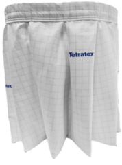
PTFE ANT Antistatic PTFE filter (M class EN 60335-2-69)