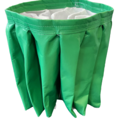
MTF Teflon filter (M class EN 60335-2-69)