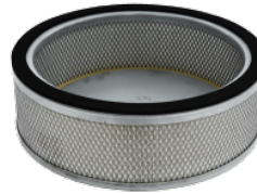
HEPA 14 Absolute filter (EN 1822) 22.000 cm 2 filter surface H14 Class Filter (EN 1822) Glass fiber