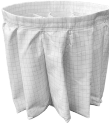
ANT M Antistatic filter (M class EN 60335-2-69)