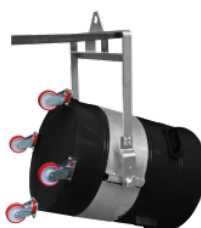
P01033 TILTING KIT FOR DUST BIN – BRACKET Ø 450MM Lifting bracket with forklift for 450 mm diameter container fitted with lifting ring. This way the vacuum's container can be lifted and tilt ...