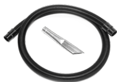
P12350 STARTER KIT Ø 50MM Basic kit containing specific accessories for 50 mm diameter solids and liquids vacuuming