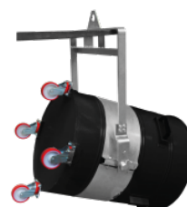
P11287 TILTING KIT FOR DUST BIN – COMPLETE RING Ø 450MM Support ring for lifting a 450 mm diameter container. Essential if used with the lifting bracket. Thanks to these two devices, the container ...