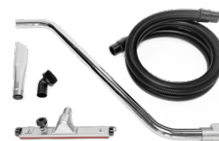
P11887 WET & DRY KIT Ø 50MM Kit containing specific accessories for 50 mm diameter solids and liquids vacuuming