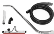
P12348 DRY KIT Ø 50MM Kit containing specific accessories for 50 mm diameter dust and solids vacuuming