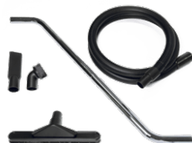
P13640 DRY KIT Ø 40MM Kit containing specific accessories for 40 mm diameter dust and solids vacuuming