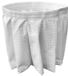
ANT M Antistatic filter (M class EN 60335-2-69)