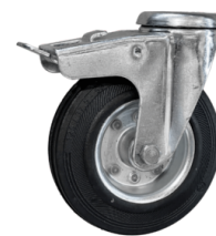
WHEEL WITH BRAKE Non-marking wheel with integrated brake