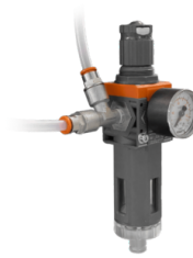
COMPRESSED AIR SUPPLY VALVE