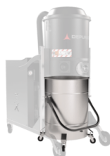
BX Stainless steel bin AISI 304