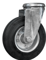
WHEELS Non-marking pivoting wheels