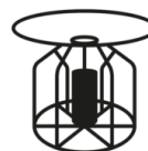
FLT Floater device