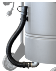
LIQUID DISCHARGE HOSE