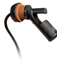
ELECTRIC FLOATING DEVICE System that automatically stops suction when the maximum level is reached