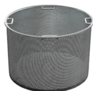
GB Metal grid basket