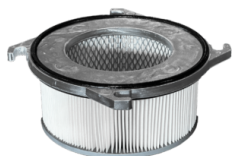
OIL-PROOF CARTRIDGE Oil-proof cartridge for motor protection