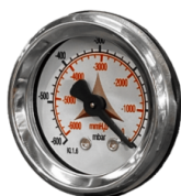
VACUUM GAUGE Vacuum gauge for indication of filter clogged or in need of replacement