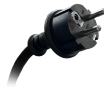
SHUKO TYPE PLUG