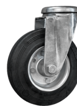
WHEELS Non-marking pivoting wheels