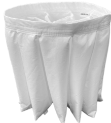
PTFE PTFE Filter (M class EN 60335-2-69)