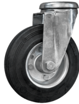
WHEELS Non-marking pivoting wheels