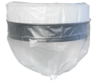
LP Endless Bag continuous roll collection system