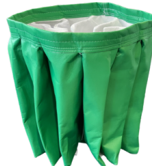
MTF Teflon filter (M class EN 60335-2-69)