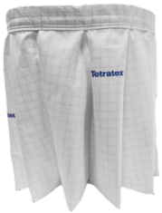
PTFE ANT Antistatic PTFE filter (M class EN 60335-2-69)