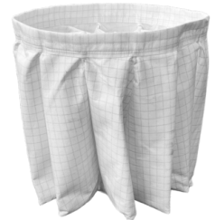
ANT M Antistatic filter (M class EN 60335-2-69)