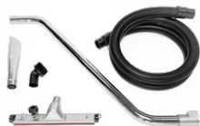
P11887 WET & DRY KIT Ø 50MM Kit containing specific accessories for 50 mm diameter solids and liquids vacuuming