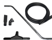
P13639 WET & DRY KIT Ø 40MM Kit containing specific accessories for 40 mm diameter solids and liquids vacuuming