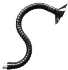
P13970 ARTICULATED SUCTION ARM D70 Flexible PVC suction arm, retrofittable on existing models - 1.2 mt length - d70