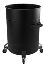
100 LT 100 Lt bin