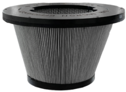
HEPA 13 Absolute filter (EN 1822) 35.000 cm 2 filter surface H13 Class Filter (EN 1822) Glass fiber