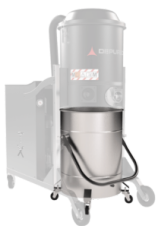
BX Stainless steel bin AISI 304