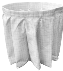
ANT M Antistatic filter (M class EN 60335-2-69)