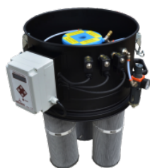
SP Automatic reverse jet cleaning system Antistatic M class filter (EN 60335-2-69), 3 Polyester filter cartridges, 9 m 2 filter surface