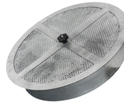
ACB Active carbon filter