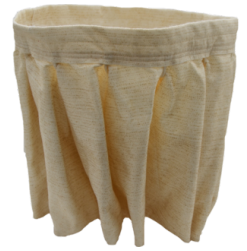
NOMEX 250° Celsius resistant filter