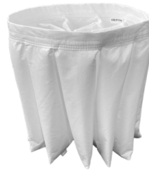
PTFE PTFE Filter (M class EN 60335-2-69)