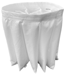
BFL M class filter 38.000 cm 2