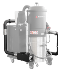
SPARK TRAP Built to capture sparks produced during welding, sanding, or polishing operations on metal parts