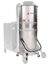
GX Stainless steel bin and chamber AISI 304