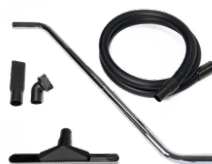
P13639 WET & DRY KIT Ø 40MM Kit containing specific accessories for 40 mm diameter solids and liquids vacuuming