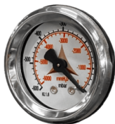
VACUUM GAUGE Vacuum gauge for indication of filter clogged or in need of replacement