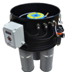
SP Automatic reverse jet cleaning system Antistatic M class filter (EN 60335-2-69), 3 Polyester filter cartridges, 9 m 2 filter surface