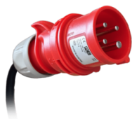
PLUG 4-pole industrial plug