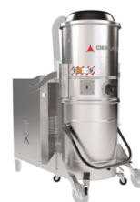
TX Stainless steel bin, chamber and frame AISI 304