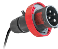
4-PIN ATEX INDUSTRIAL PLUG