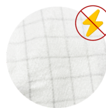
ANTISTATIC FILTRATION Antistatic filtration to discharge static energy