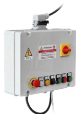
ELECTRICAL PANEL Electrical panel, implementable with additional functions