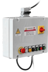
ELECTRICAL PANEL Electrical panel, implementable with additional functions