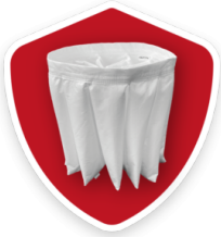
3 YEARS WARRANTY Purchasing the replacement filter along with the vacuum