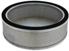
HEPA 14 Absolute filter (EN 1822) 22.000 cm 2 filter surface H14 Class Filter (EN 1822) Glass fiber