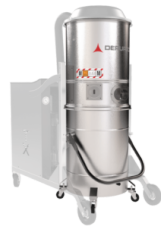
GX Stainless steel bin and chamber AISI 304