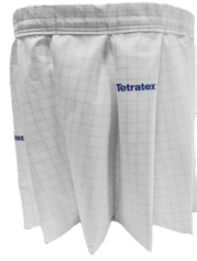
PTFE ANT Antistatic PTFE filter (M class EN 60335-2-69)