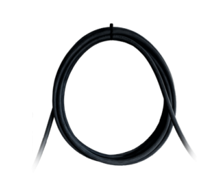
POWER SUPPLY CABLE

Vacuum gauge for indication of filter clogged or in need of replacement