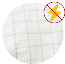
ANTISTATIC FILTRATION Antistatic filtration to discharge static energy