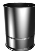
STEEL CONSTRUCTION Rugged industrial coated steel construction