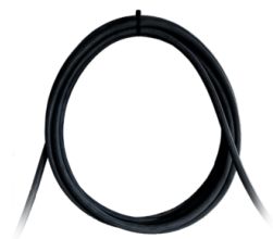
POWER SUPPLY CABLE

Vacuum gauge for indication of filter clogged or in need of replacement