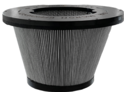
HEPA 13 Absolute filter (EN 1822) 35.000 cm 2 filter surface H13 Class Filter (EN 1822) Glass fiber