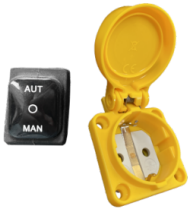
RC SCHUKO Remote control by power tool (MAX 2000 W)