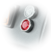
FILTER CLOGGING INDICATOR Filter clogged or need to be replaced indicator light